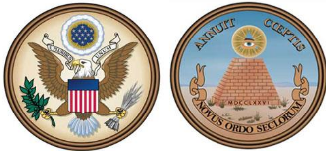
The Great Seal of the United States.

On the front of the Great Seal of the United States there is a cloud, a sunburst, and thirteen stars above the eagle. The phrase on the banner, E PLURIBUS UNUM, contains thirteen letters. It means “Out of many, one.” On July 4, 1776, the thirteen colonies became one nation with the signing of the Declaration of Independence.